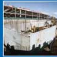
Remsen Avenue Yard