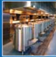
Rikers Island Kitchen