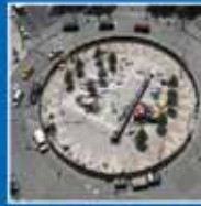
Frederick Douglass Circle