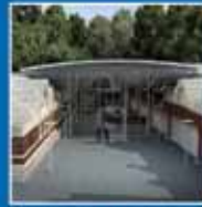
Central Park Police Precinct