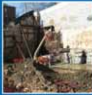
Riverdale Retaining Wall

At URS, we believe that a successful result seldom comes about by chance. So whether it's a roadway, school, police station or correctional facility, our determination never changes. To do it better. Which is why, when it comes to infrastructure, more people turn to URS.